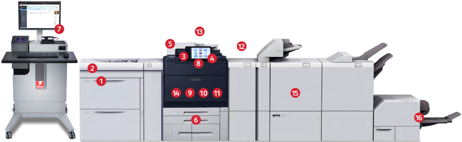
Shown: Fiery® EX Print Server, Two-Tray Oversized High Capacity Feeder, Xerox® PrimeLink® C9200 Series Printer, Crease and Two-Sided Trimmer, Xerox® Production Ready Booklet Maker Finisher, Xerox® SquareFold® Trimmer